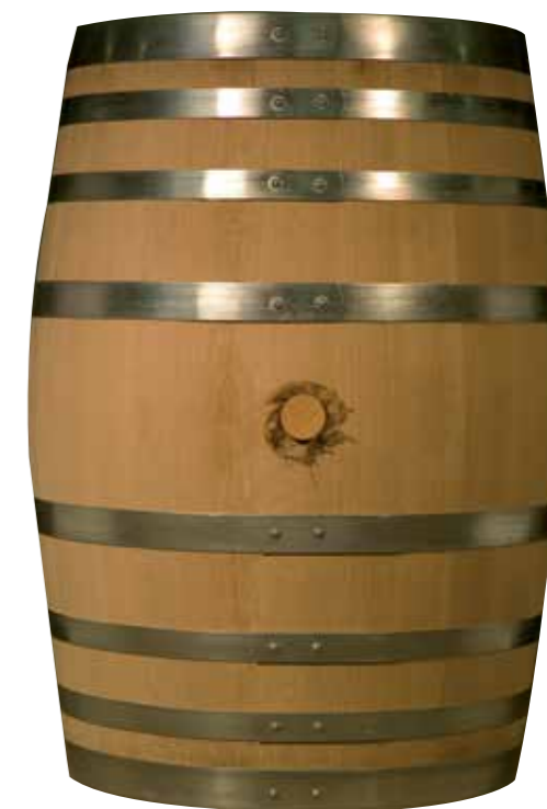
Bordeaux 225 L 8 galvanized hoops